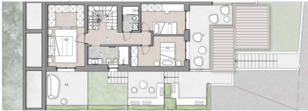
PIANO PRIMO | General Plan 1:150