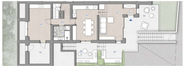
PIANO TERRA | General Plan 1:50

PIANO INTERRATO | 2 POSTI AUTO, CANTINA PIANO TERRA | AREA LIVING E CUCINA, BAGNO, LAVANDERIA, LOCALE TECNICI PIANO PRIMO | 3 CAMERE, 2 BAGNI, 2 TERRAZZE PIANO TERRAZZA | TERRAZZA PRATICABILE