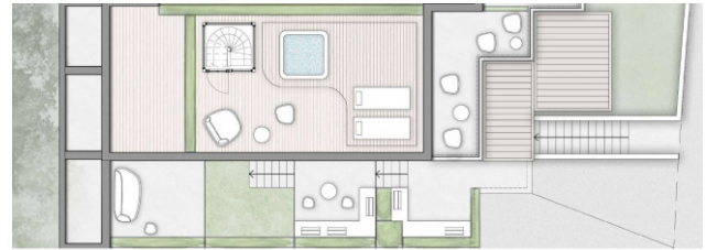
PIANO TERRAZZA | General Plan 1:150