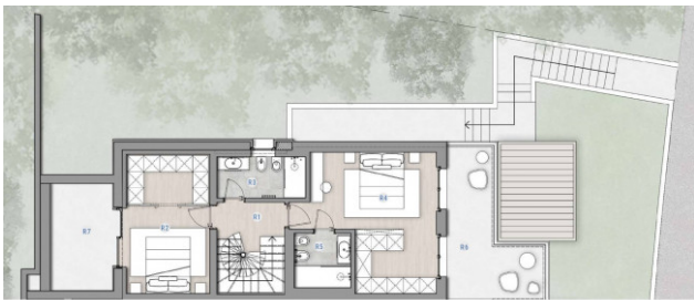
PIANO PRIMO | General Plan 1:50