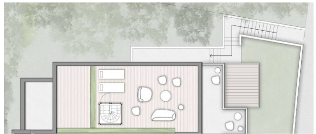
PIANO TERRAZZA | General Plan 1:50